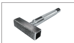
Ref : 2231 Diamond wheel dresser