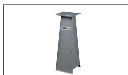
Ref : 9399 Optional base