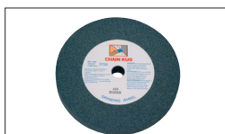
Ref : 9340 36 Gr grinding wheel