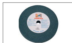
Ref : 9341 60 Gr grinding wheel