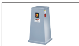
Ref : 300Z Optional base